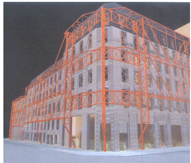
Global view of temporary structure (outside)